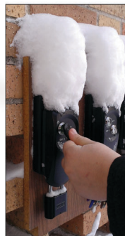
Clocking in after a blizzard.