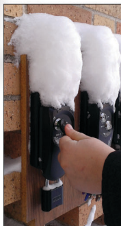
Clocking in after a blizzard.