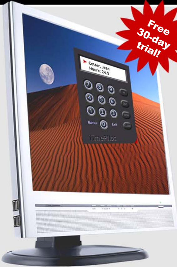
(Monitor not included)