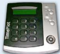
Time Clock Station