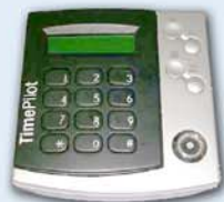
Time Clock Station