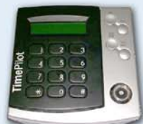
Time Clock Station