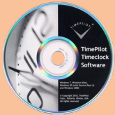
TimePilot Central Software CD